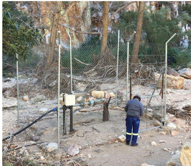
Figure 1 Typical borehole enclosure / fence

Boreholes are not fully enclosed in brick structures, though access is limited at most boreholes where a tripod will have to be used to remove equipment. Access to borehole GZ00347 is unlimited and a testing rig/truck will be able to gain access for pump installation and testing purposes. The following image depicts the typical fence installed around the boreholes.