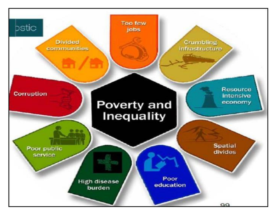
SA 2030 Development Plan and South Africa's 9 key Challenges