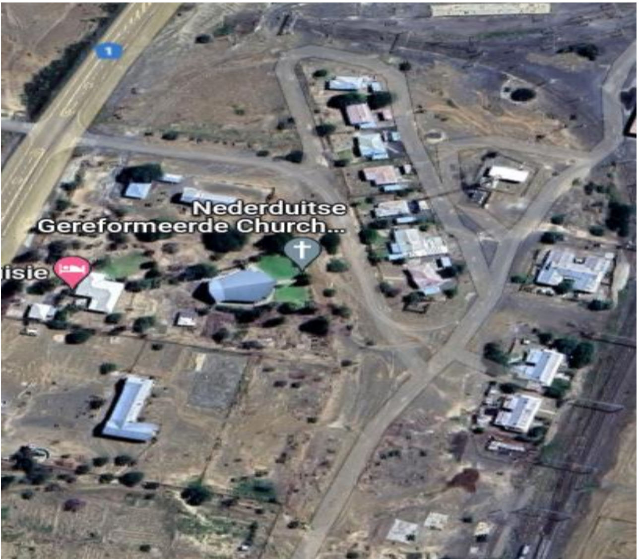
FIG 8: TRANSNET / PRASA HOUSING SETTLEMENT