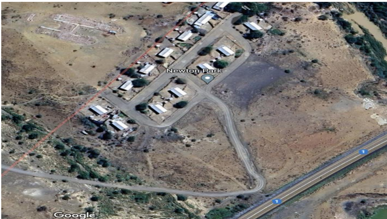
FIG 3: NEWTON PARK HOUSING SETTLEMENT