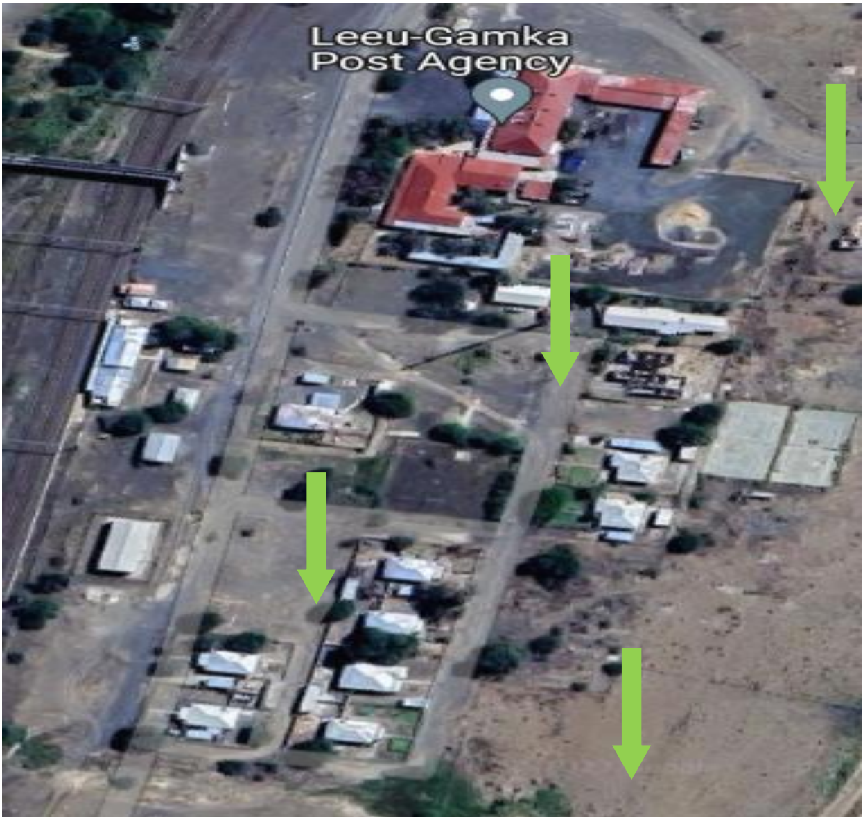
FIG 7: PRASA HOSUING UNITS- LOW POINTS FOR PUMP STATION SITE