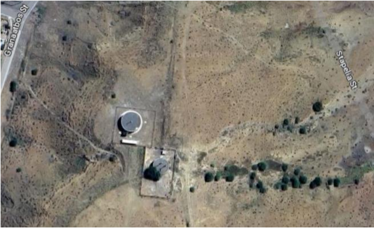
FIG 4: RESERVOIRS AND TREATMENT WORKS