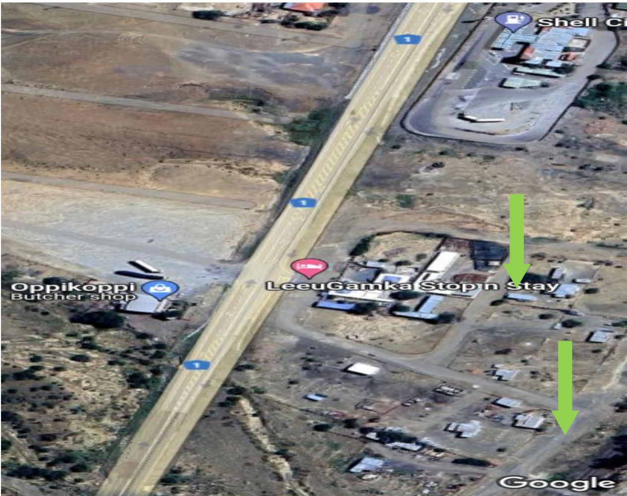
FIG 9: WELGEMOED SETTLEMENT