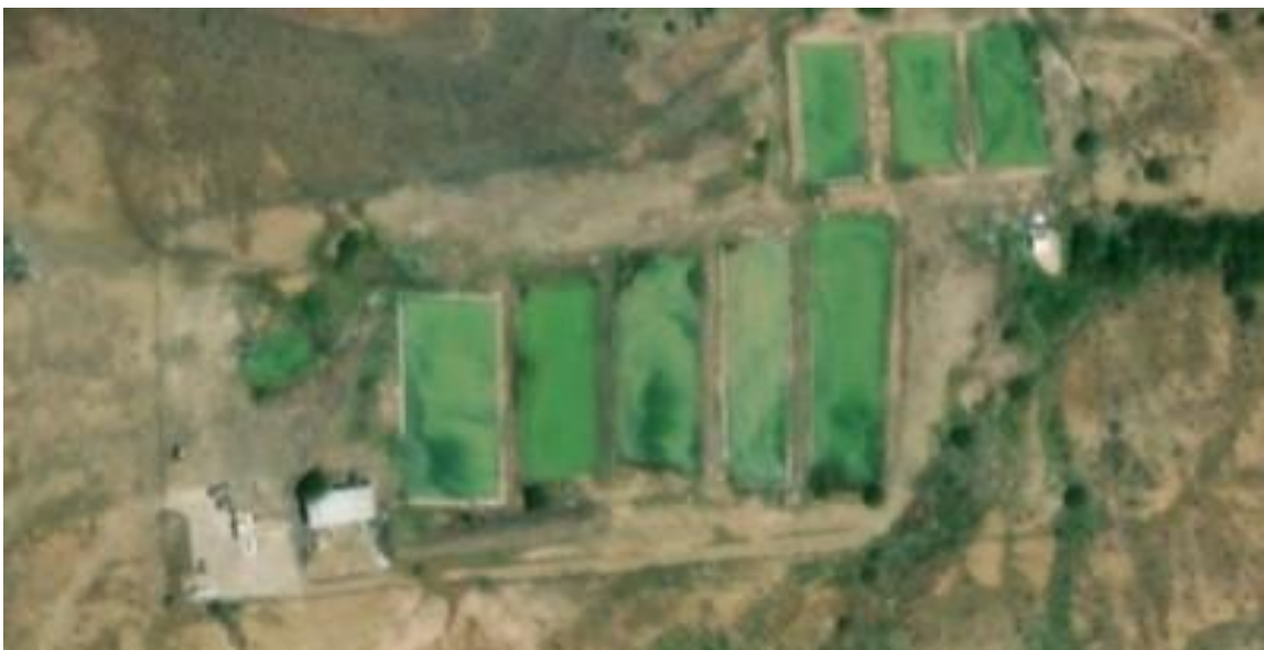
FIGURE 1 – LEEU-GAMKA WASTE WATER TREATMENT WORKS