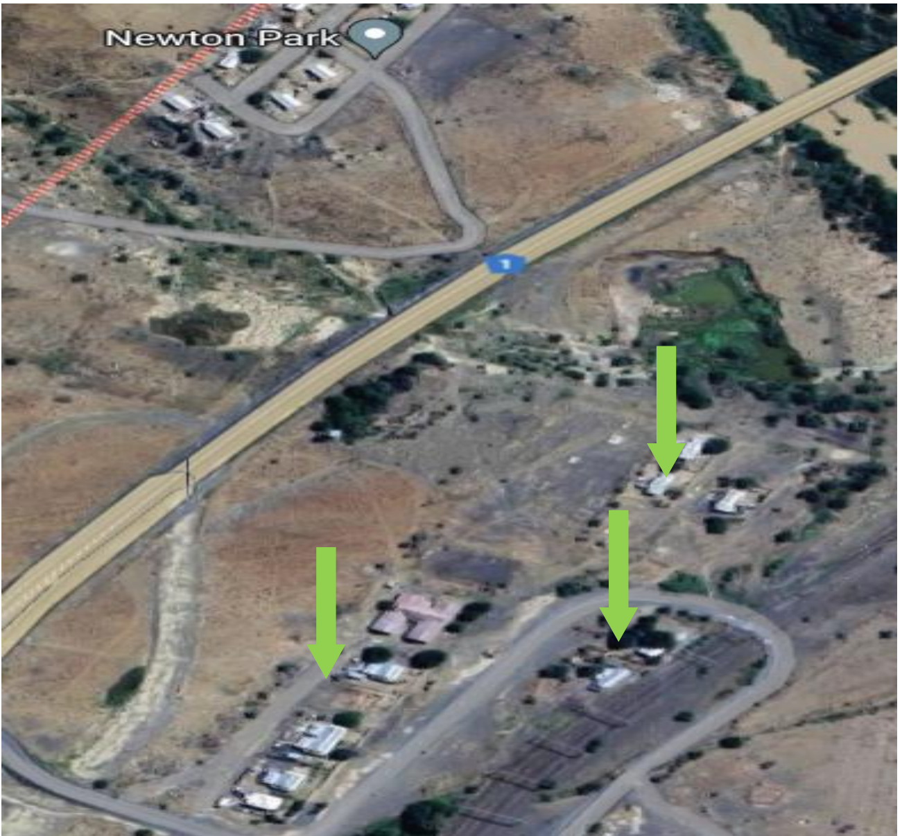
FIG 6: TRANSNET HOUSING SCHEME