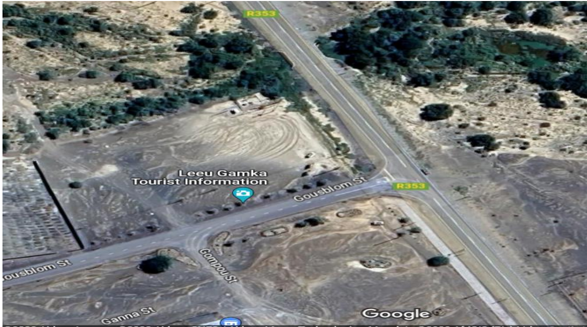
FIG 2: WASTE WATER PUMP STATION