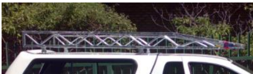
Illustration of roof rack on canopy