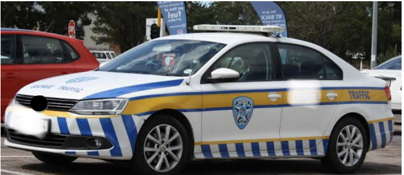
Graphic illustration of vehicle with branding and lighting.